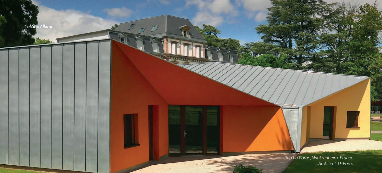
Itep La Forge, Wintzenheim, France. Architect: D-Form.