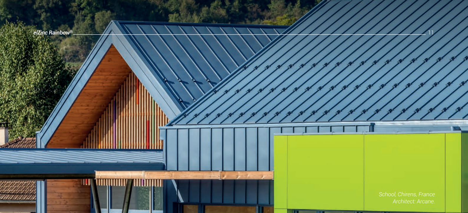
School, Chirens, France