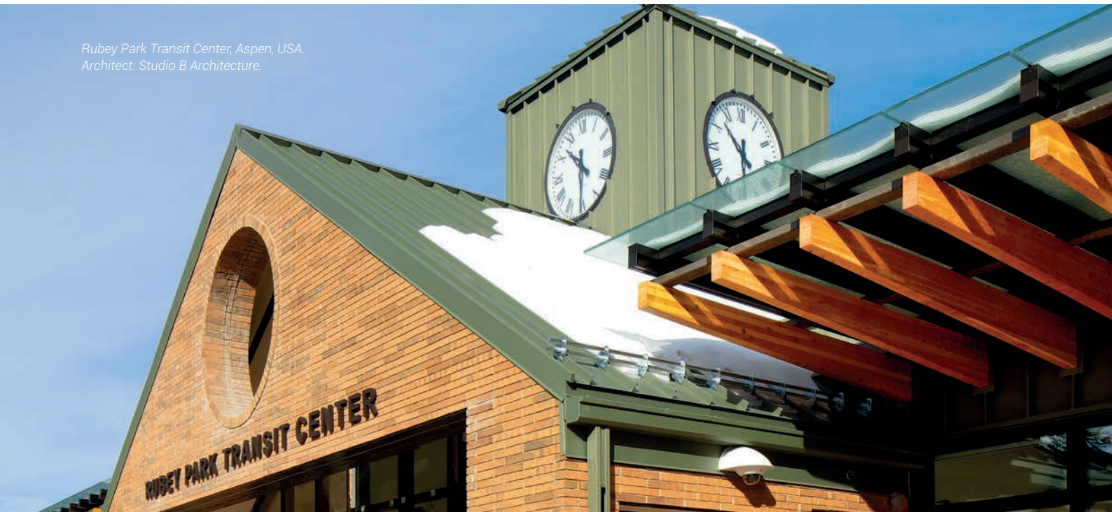
Rubey Park Transit Center, Aspen, USA. Architect: Studio B Architecture.