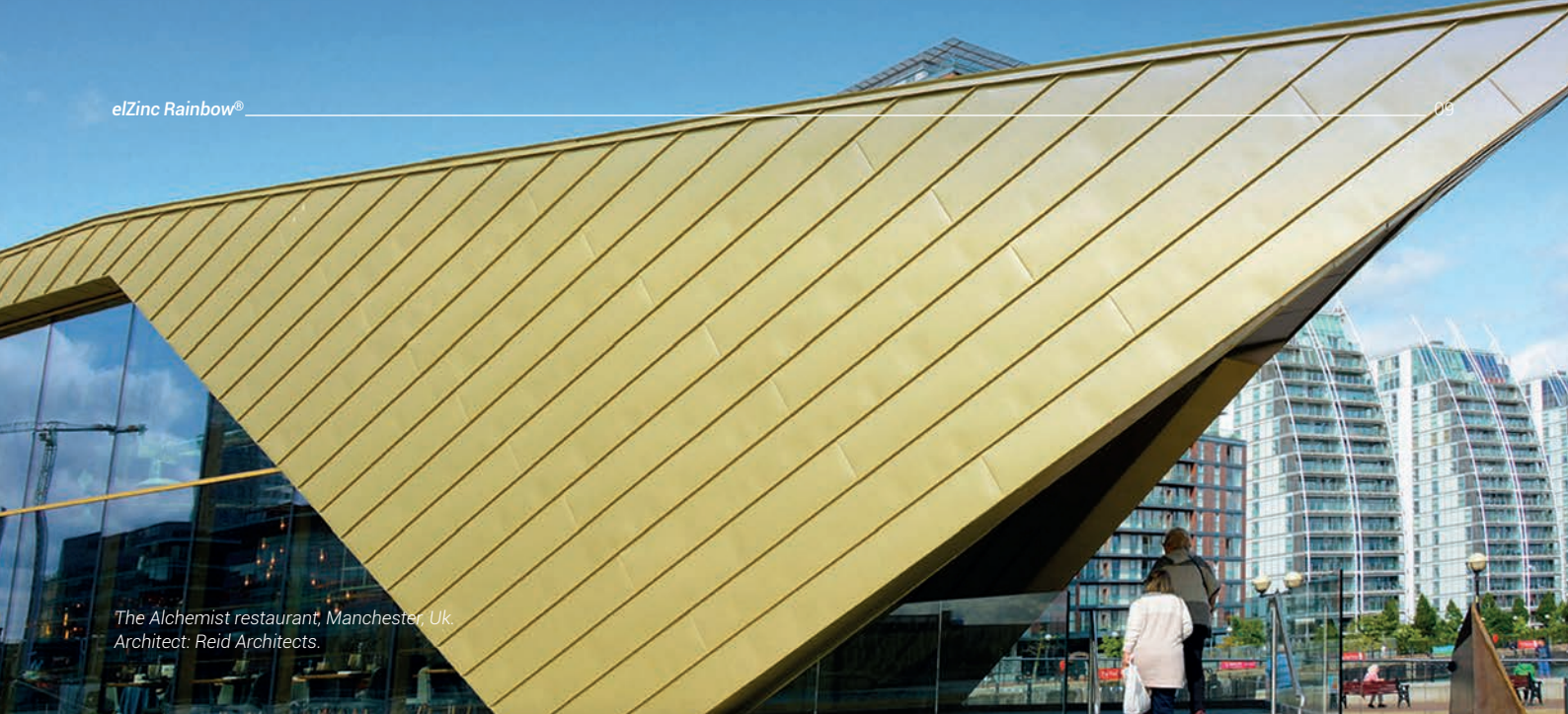
The Alchemist restaurant, Manchester, UK. Architect: Reid Architects.