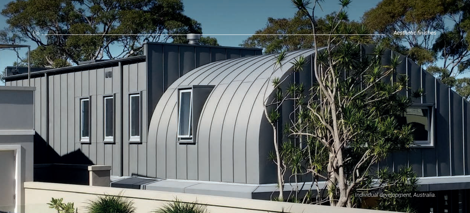
Individual development, Australia.