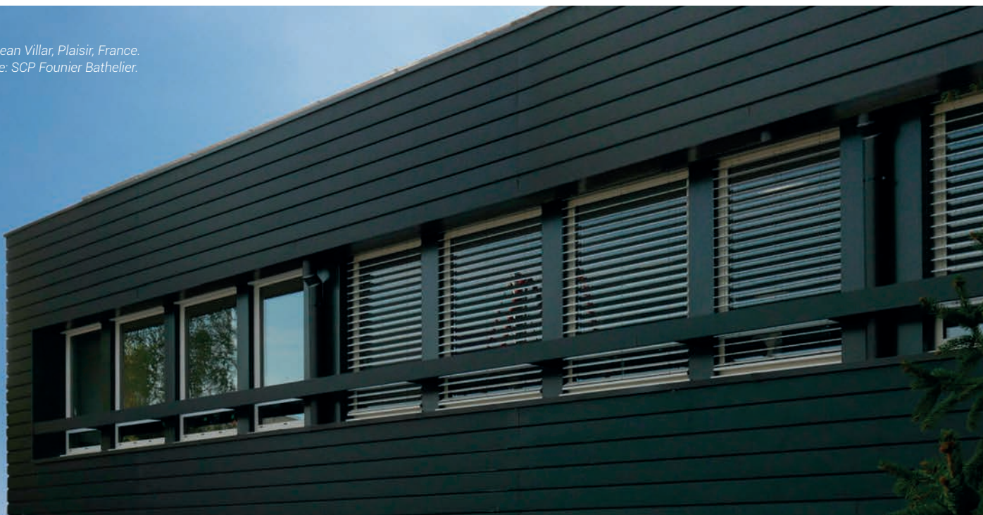
Collège Jean Villar, Plaisir, France. Architecte: SCP Fournier Bathelier.

automatically on exposure to the weather, turns the finish to a pleasant matt grey colour. It also provides a self-healing protective layer giving it exceptional resistance against corrosion.