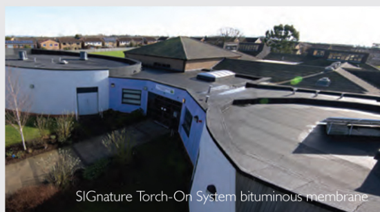
SIGNature Torch-On System bituminous membrane