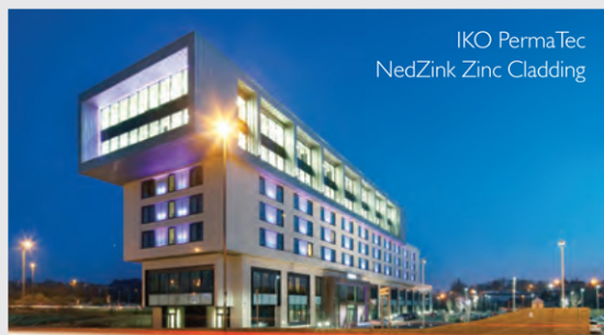
IKO PermaTec NedZink Zinc Cladding