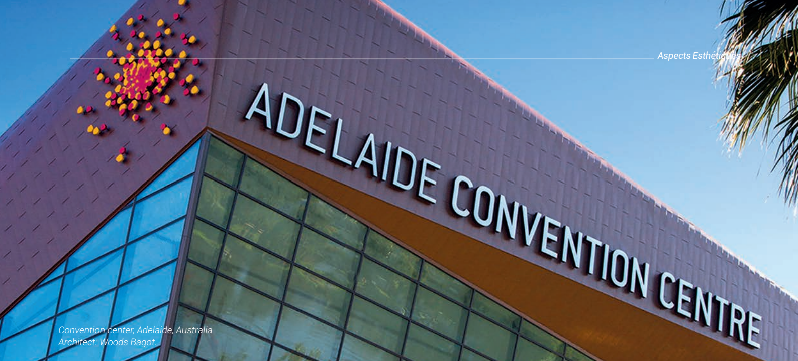
Convention center, Adelaide, Australia Architect: Woods Bagot.