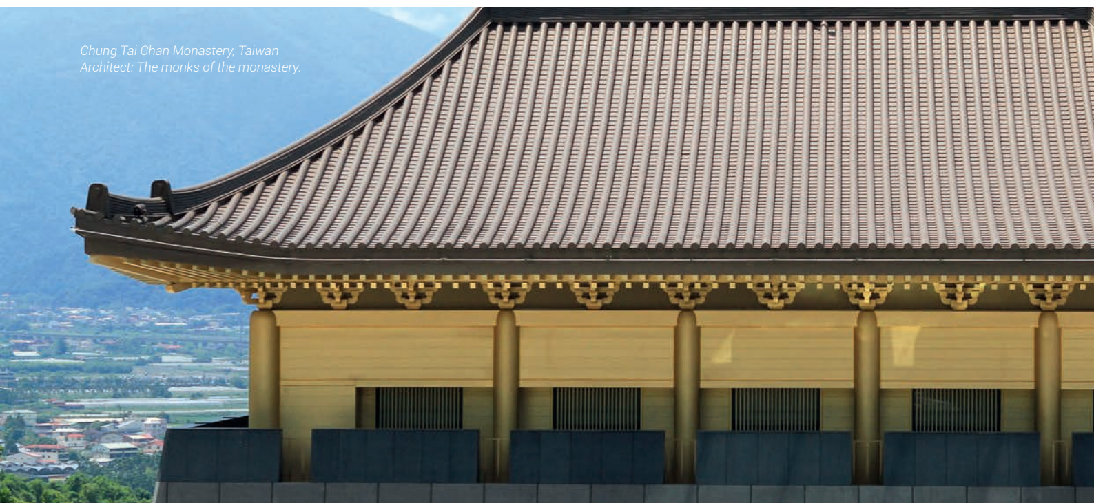
Chung Tai Chan Monastery, Taiwan Architect: The monks of the monastery.